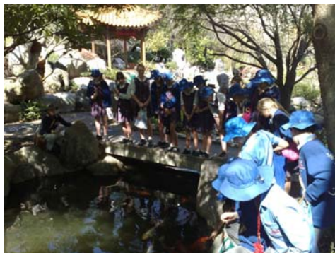
Stage 3 students enjoying the tranquility of the Chinese Gardens

In the enchanting Chinese Garden of Friendship, the students solved riddles, found clues and met challenges as they journeyed through the garden and learnt the legend of the Chinese horoscope. The whole experience of “Chinese Whispers” was another dimension to their work at school that has been undertaken this term.